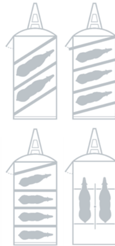
Typical partition layouts of HB510XL